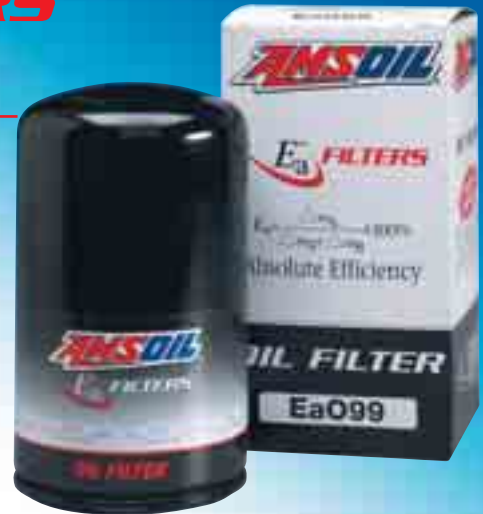
Filter Efficiency @ 15 Micron per ISO 4548-12

If used in conjunction with AMSOIL Motor Oil that is being changed at intervals less than 25,000 miles, the EaO Filter should be changed at the same time. AMSOIL EaO Filters are not guaranteed for 25,000 miles when used with any oil other than AMSOIL Motor Oil and should be changed according to vehicle OEM recommendations.