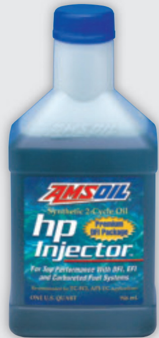
NMMA TC-W3 API TC